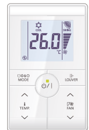
Simple Wired Controller*# (High Grade)

*Optional Communication Kit required for connection.