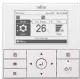
UTY-RVNY Backlit Wired Remote Controller* (High Grade)