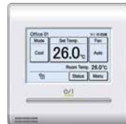
Wired Touch Controller*#