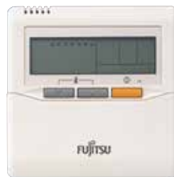
UTY-RNNY Wired Remote Controller*