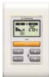
UTYRSNY Simple Wired Controller*